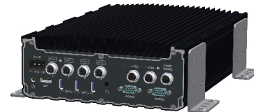
▲ SEMIL wall-mounted