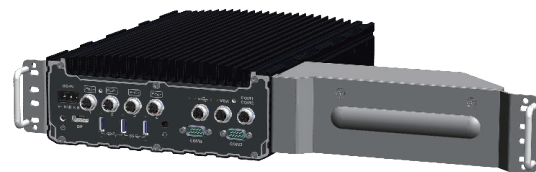
▲ SEMIL 19" rack-monuted